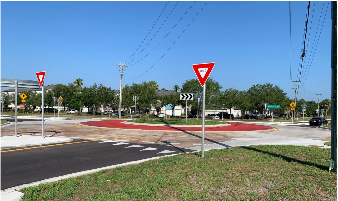
Looking Southwest Across the Roundabout