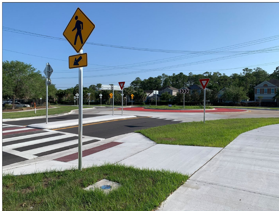
Mantague looking Northwest to Memorial